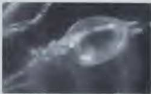
Fig. 3. Fruit of Trithuria lanterna (Holotype). Pedicel at right; persistent tangled stigmas at left.

pected to occur elsewhere along the north coast of Australia. T. lanterna is the only species of Trithuria Hook. f. recorded for tropical parts of the continent.